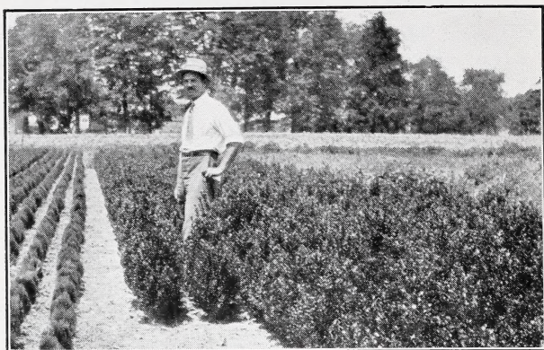
Buxus sempervirens , 1½ to 2 ft. (T).